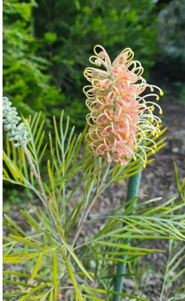
Grevillea Caloundra Gem has delicate peach coloured flowers