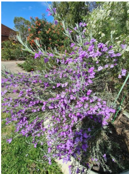
Stunning Eremophila nivea x drummondii - a vision in blue