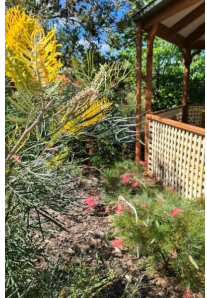
Grevillea Bush Lemon flowers almost all year – the gift that keeps on giving!