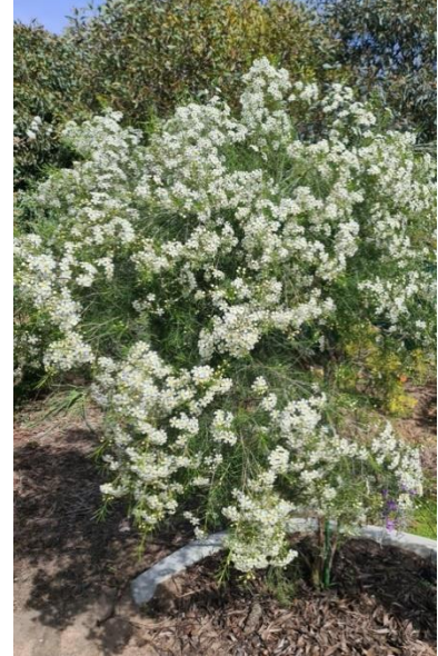
The bees love the Geraldton Wax bush which is smothered in blossoms